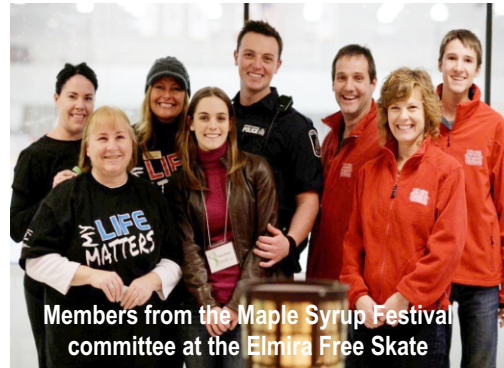
Members from the Maple Syrup Festival committee at the Elmira Free Skate