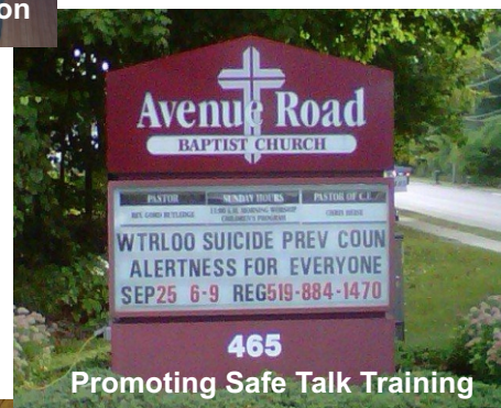
Promoting Safe Talk Training

St. Aloysius and Our Lady of Grace Schools