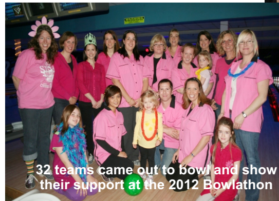
32 teams came out to bowl and show their support at the 2012 Bowlathon

“Thank you so very much for allowing people and families to benefit from your knowledge, learning and experience. Please know what you do matters so very, very much.” Father