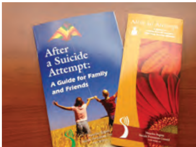
New resource materials available

The Waterloo Region Suicide Prevention Council has been part of a working committee formed by the Mental Health and Addictions Program at Grand River Hospital titled 'Suicide Prevention.' The purpose of this group was to look at ways to help individuals admitted following a suicide attempt. In the adult unit, a wellness follow up phone call is now provided within 72 hours reconnecting with individuals to see how they are doing, a safety plan and laminated wallet resource card is provided and a new booklet titled "After a Suicide – a guide for the individual" and a second booklet for the family is now available. The child and adolescent unit has also updated their safety plan, provides the booklets and a youth laminated wallet card and will be looking at ways to best implement the wellness call over the summer months.