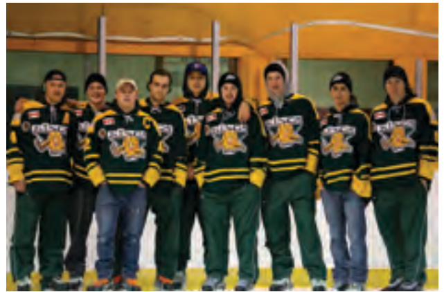
A huge thanks to the Elmira Sugar Kings for coming out and skating with the kids!

For the second year in a row, a generous gift has been made to the Waterloo Region Suicide Prevention Council from the Elmira Maple Syrup Festival committee. Understanding that strong connection to family and community support is one of the many protective factors that may enhance our personal resiliency and serve to counterbalance risks related to suicide, the Waterloo Region Suicide Prevention Council wanted to share the proceeds of this gift with the Woolwich community. On January 2, 2014, we hosted our second annual My Life Matters Free Family Skate at the Woolwich Township Arena in St. Jacobs. We were joined by the local Junior B hockey team, the Elmira Sugar Kings and approximately 70 friends and family for a leisurely skate followed by some lovely hot chocolate and treats. We thank those of you who were able to join us!