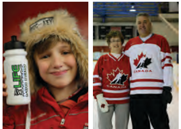
Happy skaters at the event

For the second year in a row, a generous gift has been made to the Waterloo Region Suicide Prevention Council from the Elmira Maple Syrup Festival committee. Understanding that strong connection to family and community support is one of the many protective factors that may enhance our personal resiliency and serve to counterbalance risks related to suicide, the Waterloo Region Suicide Prevention Council wanted to share the proceeds of this gift with the Woolwich community. On January 2, 2014, we hosted our second annual My Life Matters Free Family Skate at the Woolwich Township Arena in St. Jacobs. We were joined by the local Junior B hockey team, the Elmira Sugar Kings and approximately 70 friends and family for a leisurely skate followed by some lovely hot chocolate and treats. We thank those of you who were able to join us!