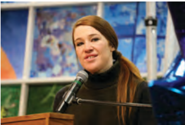
The inspirational Clara Hughes

In March, Waterloo Region was fortunate to have Clara Hughes roll into town ... literally .. on her bike! This was one of her first stops on her 12,000 kilometer journey across Canada to raise awareness for mental health. Grand River Hospital was chosen as the host for the free, family fun event and did so with great style. The night was a true community event bringing together over 900 people. Wow! Families got to try their luck at hockey, Wii, take part in arts and crafts, have their picture taken at a photo booth, have their face or body painted with inspiring messages and watch a bicycle genius perform tricks. The highlight though was the unveiling of a mural designed by students from 30 local schools to be hung in the psychiatric unit at Grand River Hospital