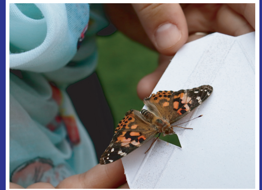
One of the butterflies from the annual World Suicide Prevention Day event and butterfly release ceremony, September 2020.

Hope, Help and Healing glass butterflies sold