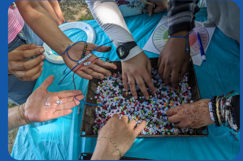
Youth creating Message Bracelets at the WRSPC booth during the Kitchener-Waterloo Multicultural Festival.

The WRSPC has been focusing on developing new opportunities to engage with the community, through hosting or participating in local events. Staff participated in or hosted 9 community events and engaged with a total of 3345 event attendees, often through collaboration with other community organizations. Event highlights of Fiscal 2024 include participation in the Kitchener-Waterloo Multicultural Festival, a summer movie night hosted in collaboration with the Kitchener Public Library featuring Inside Out, and our continued free Community Skates, held in Elmira and Ayr during the winter and March breaks.