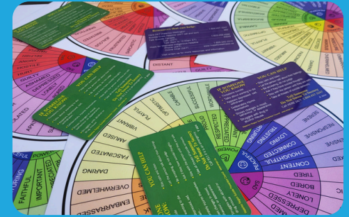
Some of the resources that have been distributed to the community, including crisis wallet cards and Feeling Wheels

We continue to facilitate Community Suicide Prevention Roundtables, which bring together representatives from community agencies and partners. 4 Roundtables were hosted, resulting in 105 learning hours for attendees.