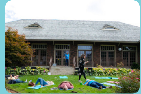
Community Members engaged in a breathwork session at World Suicide Prevention Day

100% of participants agreed/strongly agreed that they would recommend this group to others.